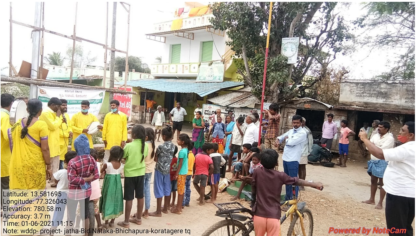
Latitude: 13.581695 Longitude: 77.326043 Elevation: 780.58 m Accuracy: 3.7 m Time: 01-06-2021 11:15 Note: wddp- project- jatha-BidNataka-Bhichapura-koratagere tq