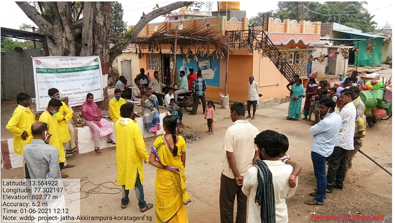
Latitude: 13.564922 Longitude: 77.302197 Elevation: 802.77 m Accuracy: 6.2 m Time: 01-06-2021 12:12 Note: wddp- project- jatha-Akkirampura-koratagere tq